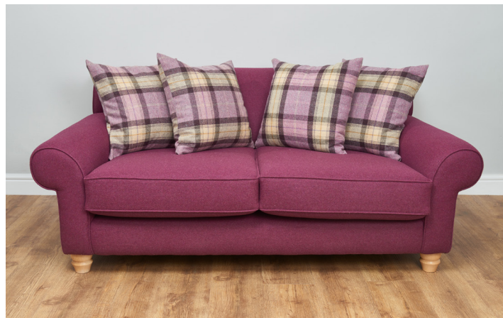
After Cushion Re-Filling Service