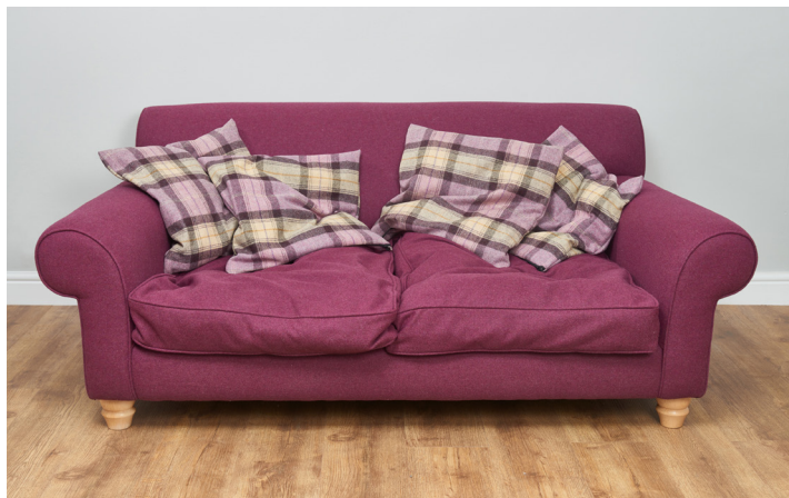
Before Cushion Re-Filling Service

Have your cushion covers professionally re-filled and returned to you within 7 days! What's more, if you are not entirely happy with the appearance and comfort of your re-filled cushions, we offer a 14 day money back guarantee.