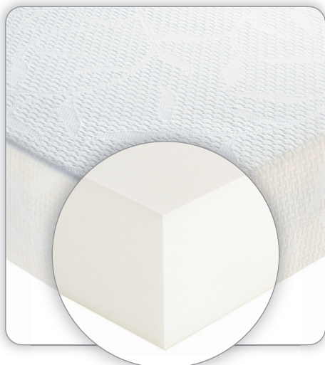
Serene Reflex Foam Mattress Available in Firm

Foam For Comfort offer 3 mattresses ranges, Serene, Luxury & Traditional Latex, all of which are available in any size or shape (an information sheet is available for each of these options giving full details and prices).