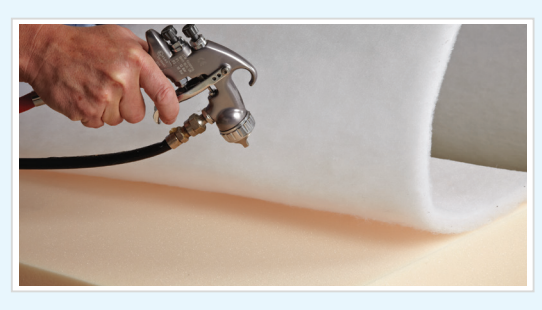
Polyester fibre being fitted to the top and bottom surface of a foam seat cushion.