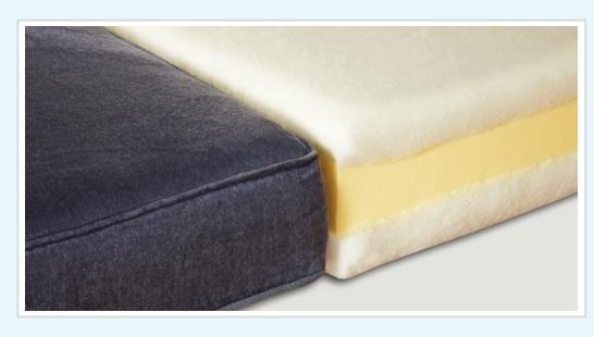
Fitting Fibre Wraps achieves that plump cushion look.