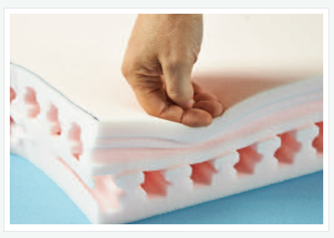
The unique interior allows the cushion to mould to your body and return to its original shape without the need for plumping.