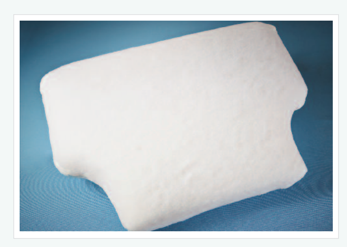
Polyester Fibre Wraps are fitted as standard to all our back cushions to enhance the final look.