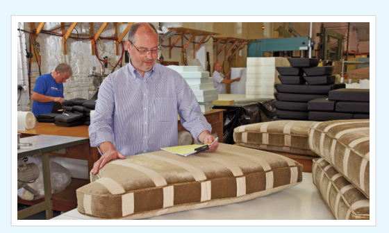
Every order is individually and carefully checked before despatch.