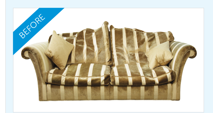
A rather sad looking sofa in need of a little TLC.

Your existing Cushion Covers professionally re-filled... Why replace your sofas and chairs when only the cushions are worn out?