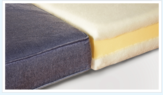
Fitting Fibre Wraps achieves that plump cushion look.