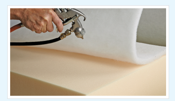
Polyester fibre being fitted to the top and bottom surface of a foam seat cushion.