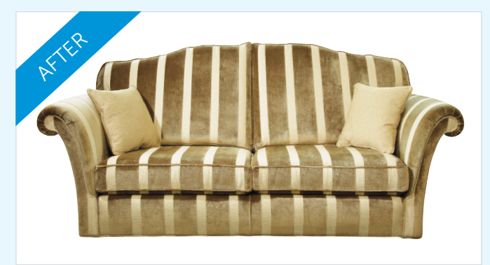
The same sofa after the Foam for Comfort treatment!