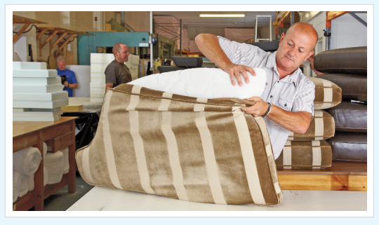
Once we are satisfied with the completed interior we do a final fitting.