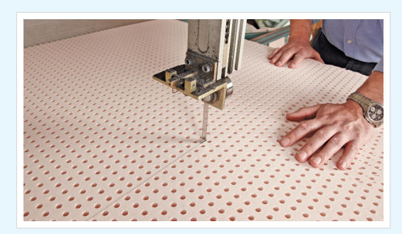
We measure and carefully cut each cushion.

From quotation to delivery we provide the level of service & quality of workmanship that our customers love.